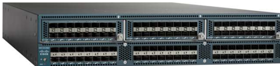
Figure 4. Cisco UCS 6296UP 96-Port Fabric Interconnect

The Cisco UCS 6296UP 96-Port Fabric Interconnect (Figure 4) is a 2RU 10 Gigabit Ethernet, FCoE and native Fibre Channel switch offering up to 1920-Gbps throughput and up to 96 ports. The switch has 48 1/10-Gbps fixed Ethernet, FCoE and Fiber Channel ports and three expansion slots.